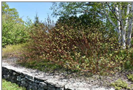
Bailey's Red Twig Dogwood in spring