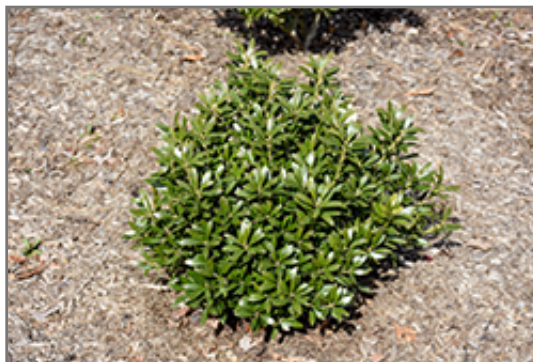
Gem Box Inkberry Holly