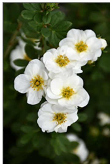
Creme Brulee Potentilla flowers