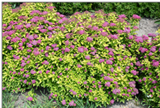
Double Play Gold Spirea in bloom