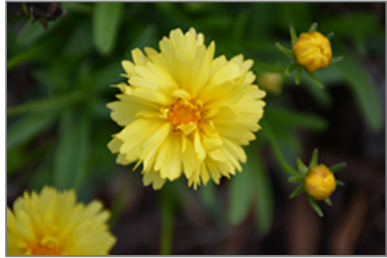
Leading Lady Charlize Tickseed flowers

Leading Lady Charlize Tickseed is recommended for the following landscape applications;