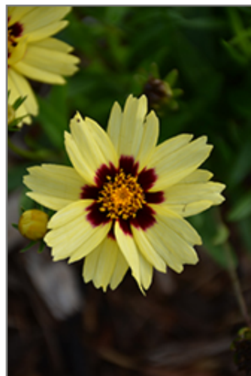
UpTick Cream and Red Tickseed flowers

UpTick Cream and Red Tickseed is recommended for the following landscape applications;