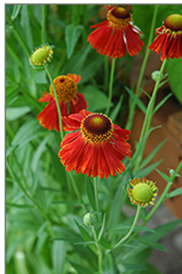
Moerheim Beauty Sneezeweed flowers