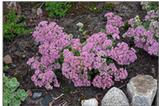
Lime Twister Stonecrop in bloom