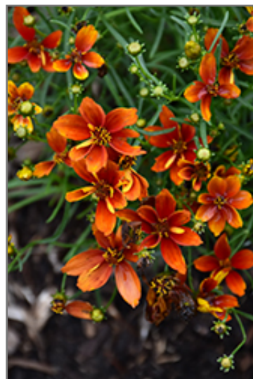
Sizzle And Spice Crazy Cayenne Tickseed flowers

Sizzle And Spice Crazy Cayenne Tickseed is recommended for the following landscape applications;