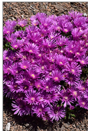
Jewel Of Desert Opal Ice Plant flowers

This is a relatively low maintenance plant, and is best cleaned up in early spring before it resumes active growth for the season. It is a good choice for attracting bees and butterflies to your yard. It has no significant negative characteristics.