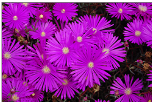
Jewel Of Desert Opal Ice Plant flowers