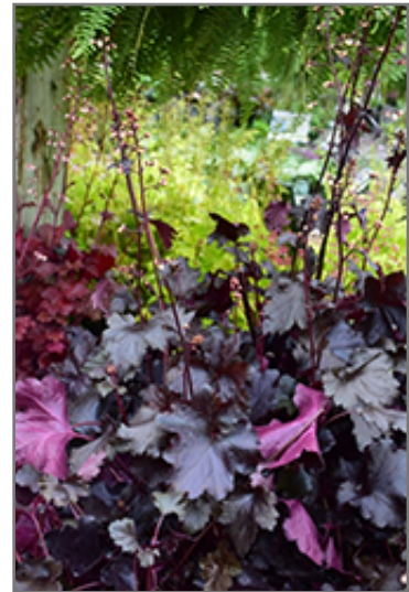
Black Pearl Coral Bells in bloom

Black Pearl Coral Bells is recommended for the following landscape applications;