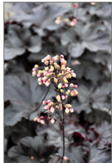
Black Pearl Coral Bells flowers