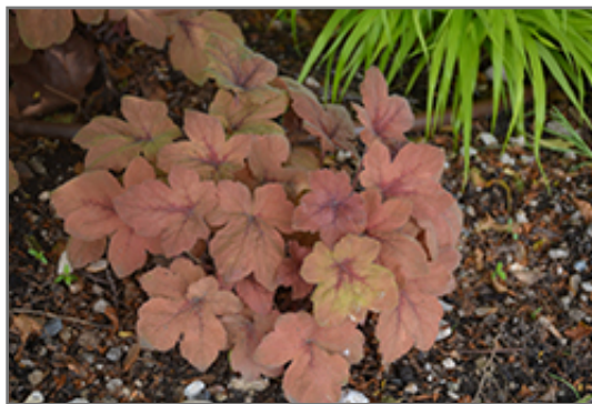
Pumpkin Spice Foamy Bells