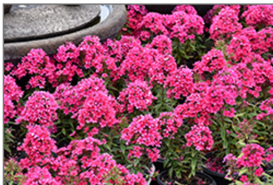
Early Red Garden Phlox flowers

Early Red Garden Phlox is recommended for the following landscape applications;