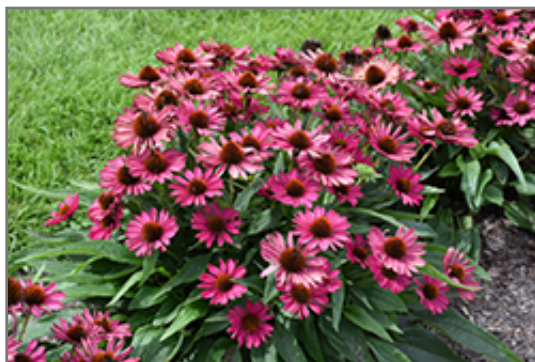
Kismet Raspberry Coneflower in bloom

Kismet Raspberry Coneflower will grow to be about 16 inches tall at maturity, with a spread of 24 inches. Its foliage tends to remain dense right to the ground, not requiring facer plants in front. It grows at a fast rate, and under ideal conditions can be expected to live for approximately 10 years. As an herbaceous perennial, this plant will usually die back to the crown each winter, and will regrow from the base each spring. Be careful not to disturb the crown in late winter when it may not be readily seen!