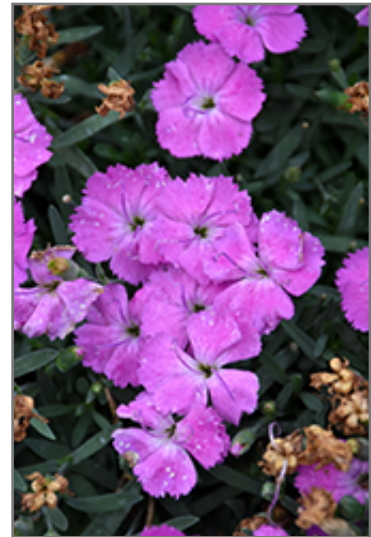
Paint The Town Fuchsia Pinks flowers

This is a relatively low maintenance plant, and is best cleaned up in early spring before it resumes active growth for the season. It is a good choice for attracting bees and butterflies to your yard, but is not particularly attractive to deer who tend to leave it alone in favor of tastier treats. It has no significant negative characteristics.