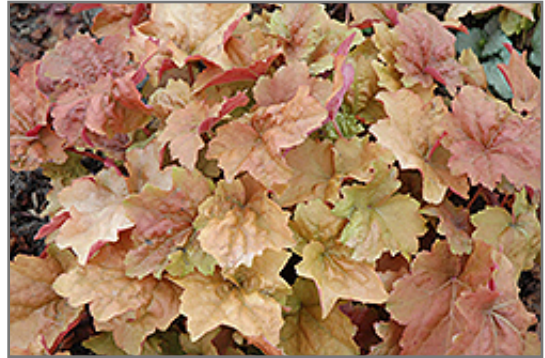
Dolce Creme Brulee Coral Bells foliage

Dolce Creme Brulee Coral Bells is recommended for the following landscape applications;