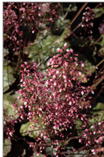
Frosted Violet Coral Bells flowers

85 CHIEF JUSTICE CUSHING HWY SCITUATE, MA 02066 781-545-1266