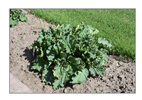
Glaskin's Perpetual Rhubarb

Glaskin's Perpetual Rhubarb features bold spikes of cherry red flowers rising above the foliage from early to mid summer, which emerge from distinctive chartreuse flower buds. Its enormous crinkled round leaves remain green in color throughout the season. The cherry red stems are very colorful and add to the overall interest of the plant.