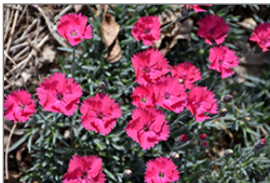
Paint The Town Magenta Pinks flowers