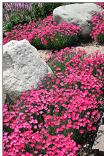
Paint The Town Magenta Pinks in bloom

Paint The Town Magenta Pinks is an herbaceous evergreen perennial with a mounded form. It brings an extremely fine and delicate texture to the garden composition and should be used to full effect.