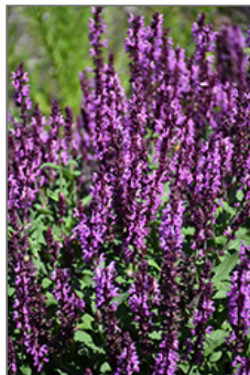
Pink Profusion Meadow Sage flowers

Pink Profusion Meadow Sage is recommended for the following landscape applications;