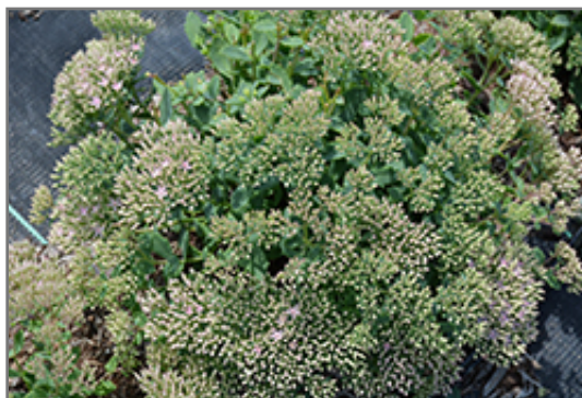
Rock Star Stonecrop flower buds

Rock Star Stonecrop is recommended for the following landscape applications;