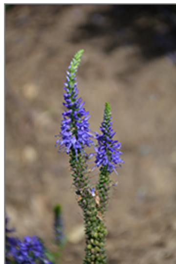
Magic Show Wizard of Ahhs Speedwell flowers