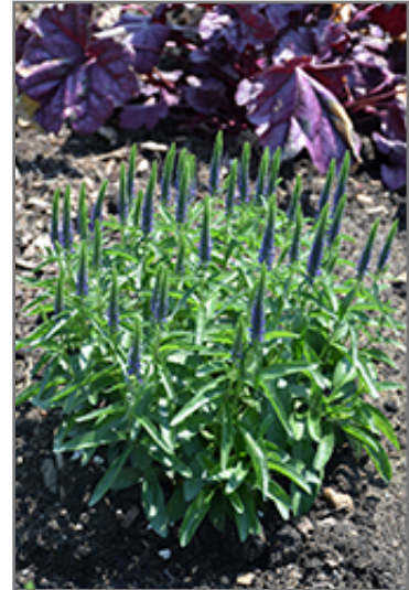
Magic Show Wizard of Ahhs Speedwell in bloom

Magic Show Wizard of Ahhs Speedwell is a fine choice for the garden, but it is also a good selection for planting in outdoor pots and containers. It is often used as a 'filler' in the 'spiller-thriller-filler' container combination, providing a mass of flowers against which the larger thriller plants stand out. Note that when growing plants in outdoor containers and baskets, they may require more frequent waterings than they would in the yard or garden.