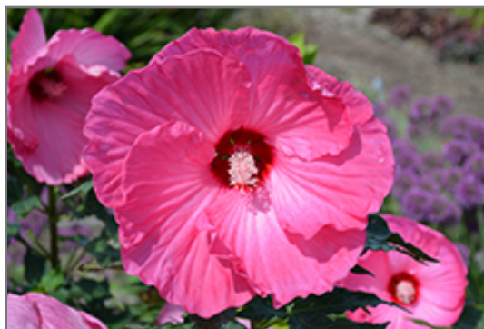
Airbrush Effect Hibiscus flowers

Airbrush Effect Hibiscus is recommended for the following landscape applications;