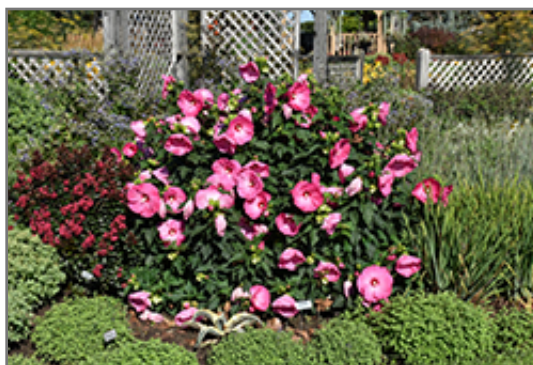
Airbrush Effect Hibiscus in bloom

85 CHIEF JUSTICE CUSHING HWY SCITUATE, MA 02066 781-545-1266