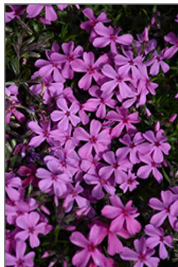
Spring Dark Pink Moss Phlox flowers

Spring Dark Pink Moss Phlox is recommended for the following landscape applications;