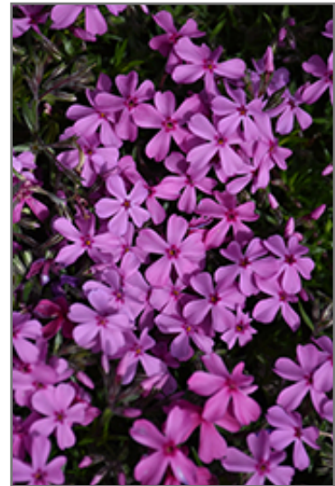
Spring Dark Pink Moss Phlox flowers

Spring Dark Pink Moss Phlox is recommended for the following landscape applications;