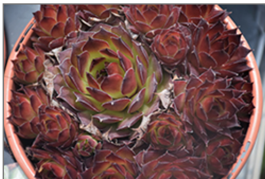
Black Hens And Chicks

* This is a 'special order' plant - contact store for details