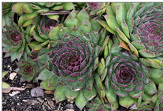
Black Hens And Chicks