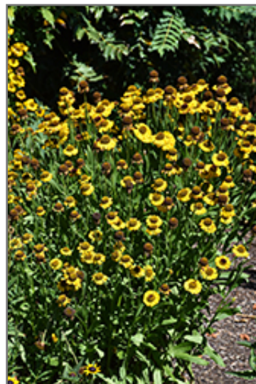
Salud Golden Sneezeweed in bloom

85 CHIEF JUSTICE CUSHING HWY SCITUATE, MA 02066 781-545-1266