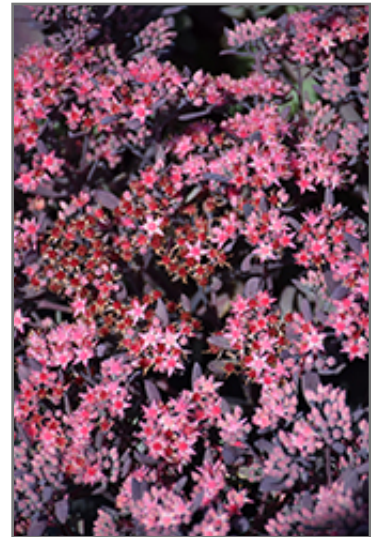
Plum Dazzled Stonecrop flowers

Plum Dazzled Stonecrop is a dense herbaceous perennial with an upright spreading habit of growth. Its medium texture blends into the garden, but can always be balanced by a couple of finer or coarser plants for an effective composition.