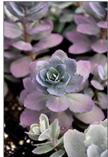
Plum Dazzled Stonecrop foliage