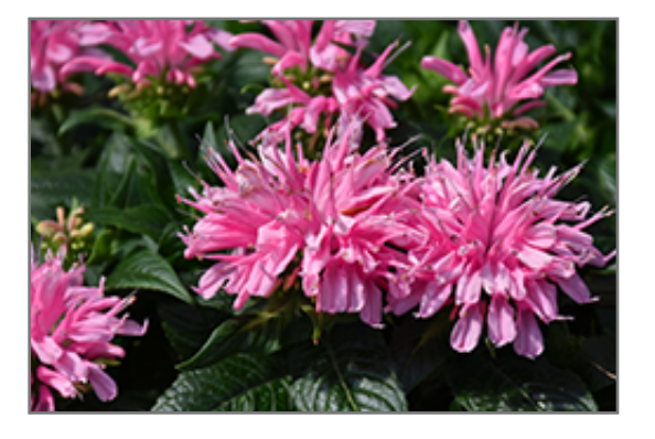
Electric Neon Pink Beebalm flowers

85 CHIEF JUSTICE CUSHING HWY SCITUATE, MA 02066 781-545-1266 www.kennedyscountrygardens.com