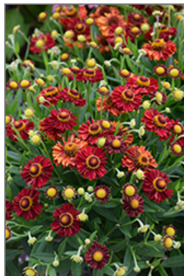
Mariachi Ranchera Sneezeweed flowers