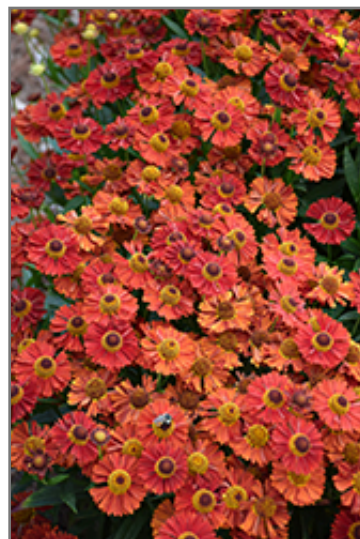
Mariachi Ranchera Sneezeweed flowers

Mariachi Ranchera Sneezeweed is an herbaceous perennial with an upright spreading habit of growth. Its medium texture blends into the garden, but can always be balanced by a couple of finer or coarser plants for an effective composition.