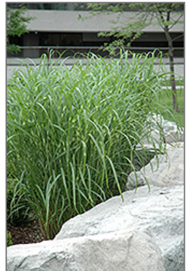
Zebra Grass