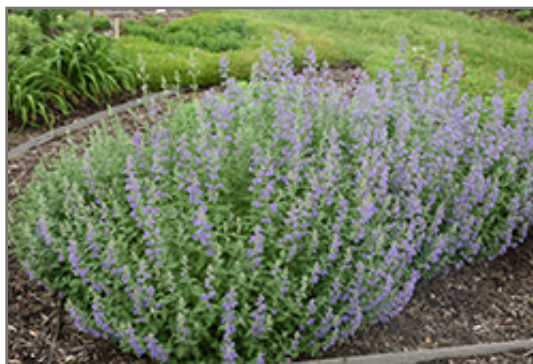
Walker's Low Catmint in bloom