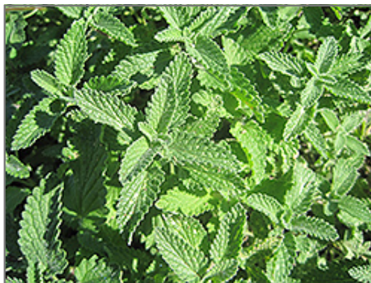
Walker's Low Catmint foliage

Walker's Low Catmint is a fine choice for the garden, but it is also a good selection for planting in outdoor pots and containers. It is often used as a 'filler' in the 'spiller-thriller-filler' container combination, providing a mass of flowers against which the thriller plants stand out. Note that when growing plants in outdoor containers and baskets, they may require more frequent waterings than they would in the yard or garden.