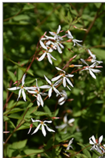
Bowman's Root flowers

This plant will require occasional maintenance and upkeep, and should be cut back in late fall in preparation for winter. It is a good choice for attracting bees and butterflies to your yard. It has no significant negative characteristics.