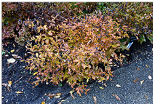
Bowman's Root in fall