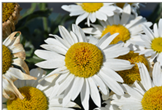
Madonna Shasta Daisy flowers

Madonna Shasta Daisy is recommended for the following landscape applications;