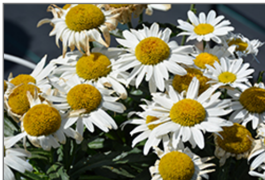
Madonna Shasta Daisy flowers