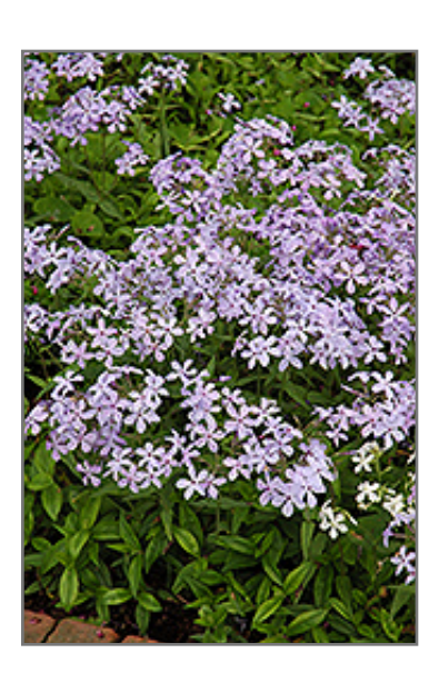
Woodland Phlox flowers

Woodland Phlox will grow to be about 8 inches tall at maturity, with a spread of 18 inches. When grown in masses or used as a bedding plant, individual plants should be spaced approximately 16 inches apart. Its foliage tends to remain low and dense right to the ground. It grows at a medium rate, and under ideal conditions can be expected to live for approximately 10 years. As an herbaceous perennial, this plant will usually die back to the crown each winter, and will regrow from the base each spring. Be careful not to disturb the crown in late winter when it may not be readily seen!