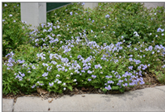
Creeping Jacob's Ladder in bloom