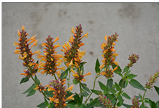
Kudos Gold Hyssop flowers