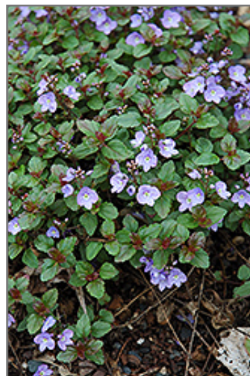
Waterperry Blue Speedwell in bloom