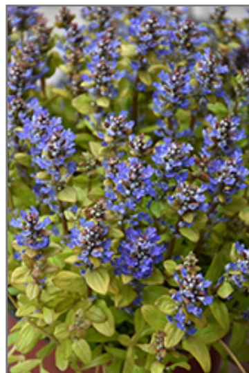
Feathered Friends Fancy Finch Bugleweed flowers