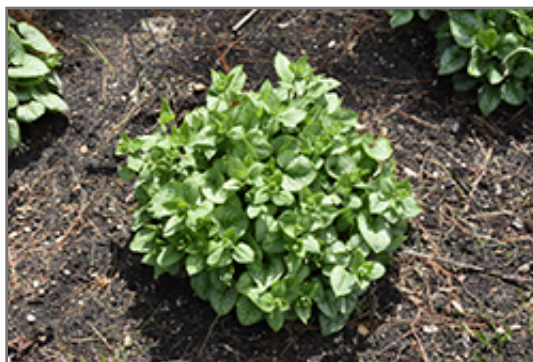
Jack of Diamonds Bugloss

Jack of Diamonds Bugloss will grow to be about 14 inches tall at maturity, with a spread of 30 inches. When grown in masses or used as a bedding plant, individual plants should be spaced approximately 28 inches apart. It grows at a medium rate, and under ideal conditions can be expected to live for approximately 10 years. As an herbaceous perennial, this plant will usually die back to the crown each winter, and will regrow from the base each spring. Be careful not to disturb the crown in late winter when it may not be readily seen!