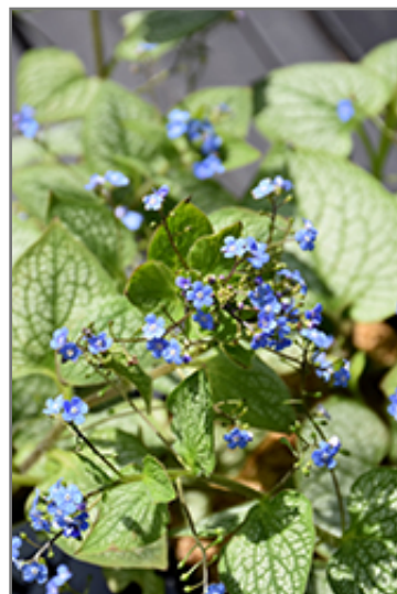
Jack of Diamonds Bugloss flowers

Jack of Diamonds Bugloss is recommended for the following landscape applications;