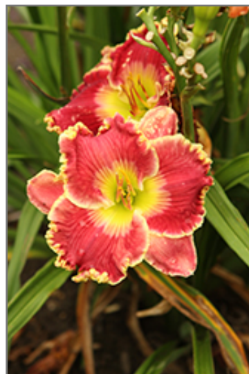
Born To Run Daylily flowers

Striking rich red to rose-pink trumpets, with contrasting yellow-green throats and butter yellow, ruffled pie-crust edges; sturdy, strong, easy to care for, great grassy texture and form; perfect for massing along borders