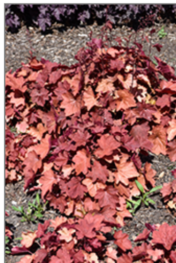
Carnival Cinnamon Stick Coral Bells