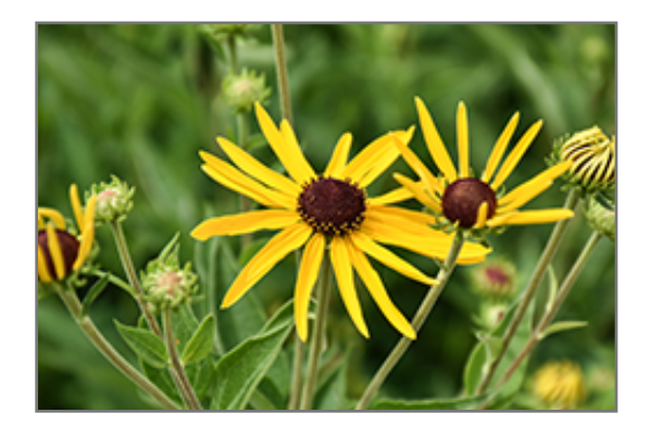
Sweet Coneflower flowers

85 CHIEF JUSTICE CUSHING HWY SCITUATE, MA 02066 781-545-1266 www.kennedyscountrygardens.com