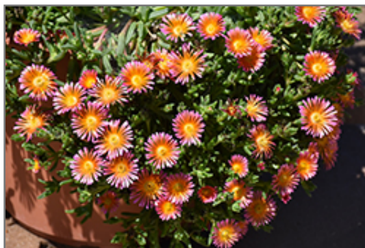
Ocean Sunset Orange Glow Ice Plant flowers