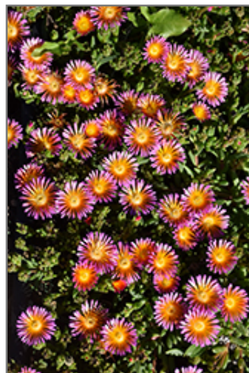
Ocean Sunset Orange Glow Ice Plant flowers

Ocean Sunset Orange Glow Ice Plant will grow to be only 4 inches tall at maturity extending to 6 inches tall with the flowers, with a spread of 12 inches. When grown in masses or used as a bedding plant, individual plants should be spaced approximately 10 inches apart. Its foliage tends to remain low and dense right to the ground. It grows at a fast rate, and under ideal conditions can be expected to live for approximately 5 years. As an evergreen perennial, this plant will typically keep its form and foliage year-round.