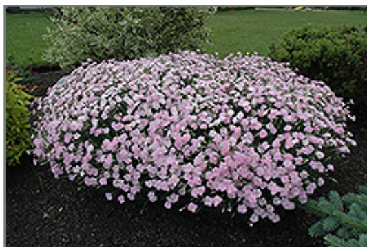
Mountain Mist Pinks in bloom