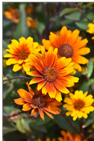
Summer Eclipse False Sunflower flowers

This is a relatively low maintenance plant, and is best cleaned up in early spring before it resumes active growth for the season. It is a good choice for attracting butterflies to your yard. It has no significant negative characteristics.