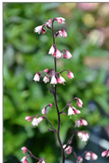
Dolce Frosted Berry Coral Bells flowers

* This is a 'special order' plant - contact store for details