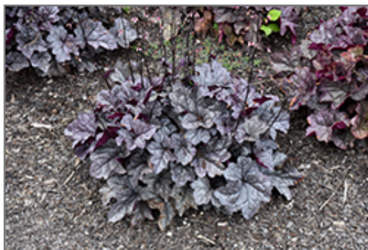
Dolce Frosted Berry Coral Bells