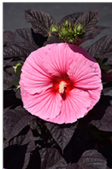
Summerific Edge of Night Hibiscus flowers

Summerific Edge of Night Hibiscus is recommended for the following landscape applications;