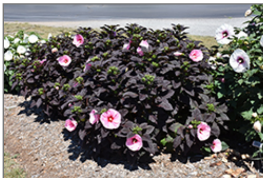
Summerific Edge of Night Hibiscus in bloom