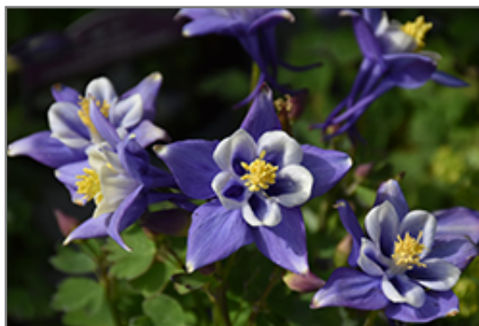
Earlybird Blue and White Columbine flowers