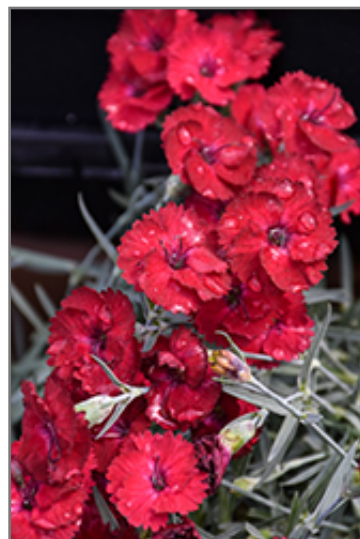
Mountain Frost Red Garnet Pinks flowers