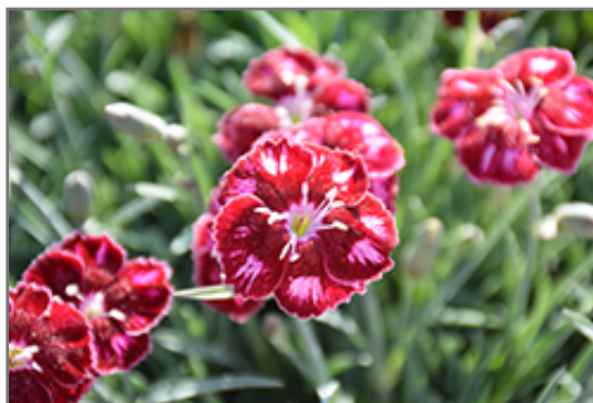
Mountain Frost Ruby Glitter Pinks flowers